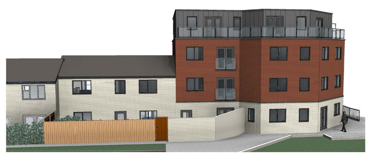
-West Perspective View