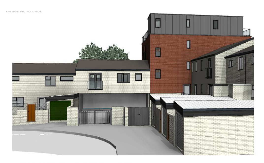
-North Perspective View