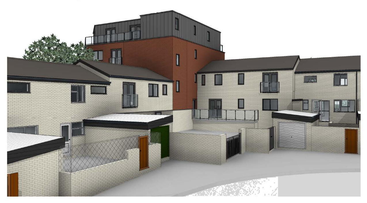
-East Perspective View