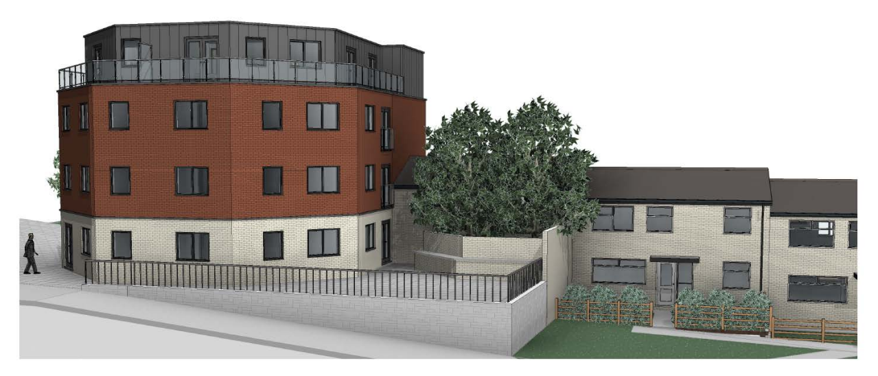
South East Perspective View